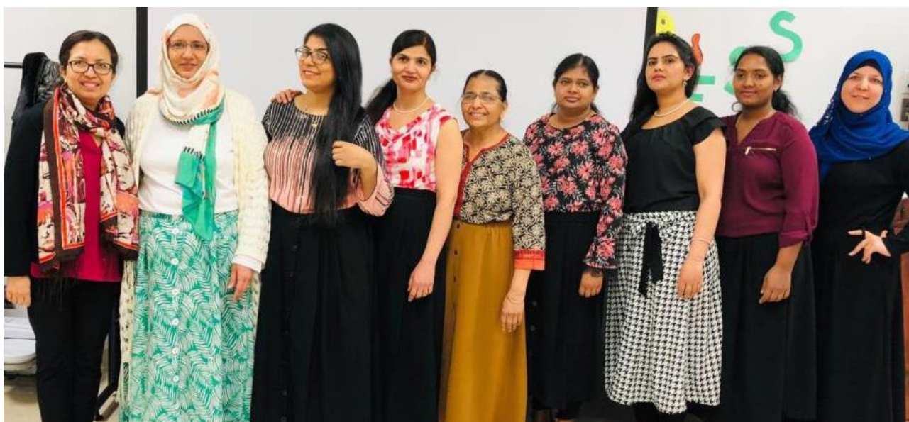
Graduates from our new Sewing Entrepreneurship Program.